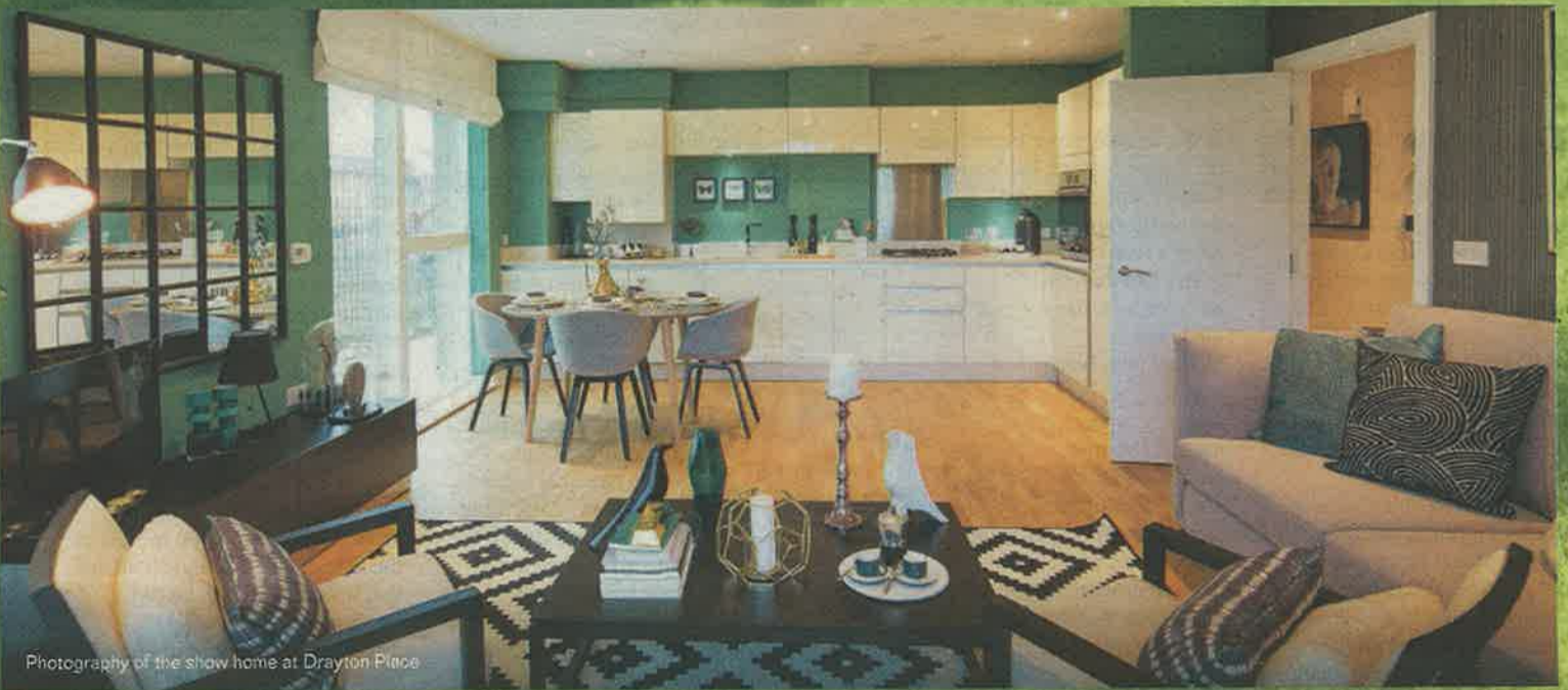
Photography of the show home at Drayton Place