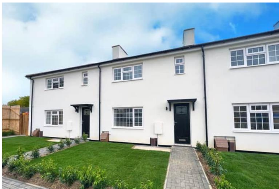
The former MOD homes, which received a makeover from Annington.